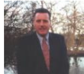
Vernon Coaker, Minister for Crime Reduction

A mix of MPs, people from youth sector organisations and young people! Vernon Coaker, Minister of Crime Reduction is due to attend as Jacqui Smith, Home Secretary, was unable to make it in the end.